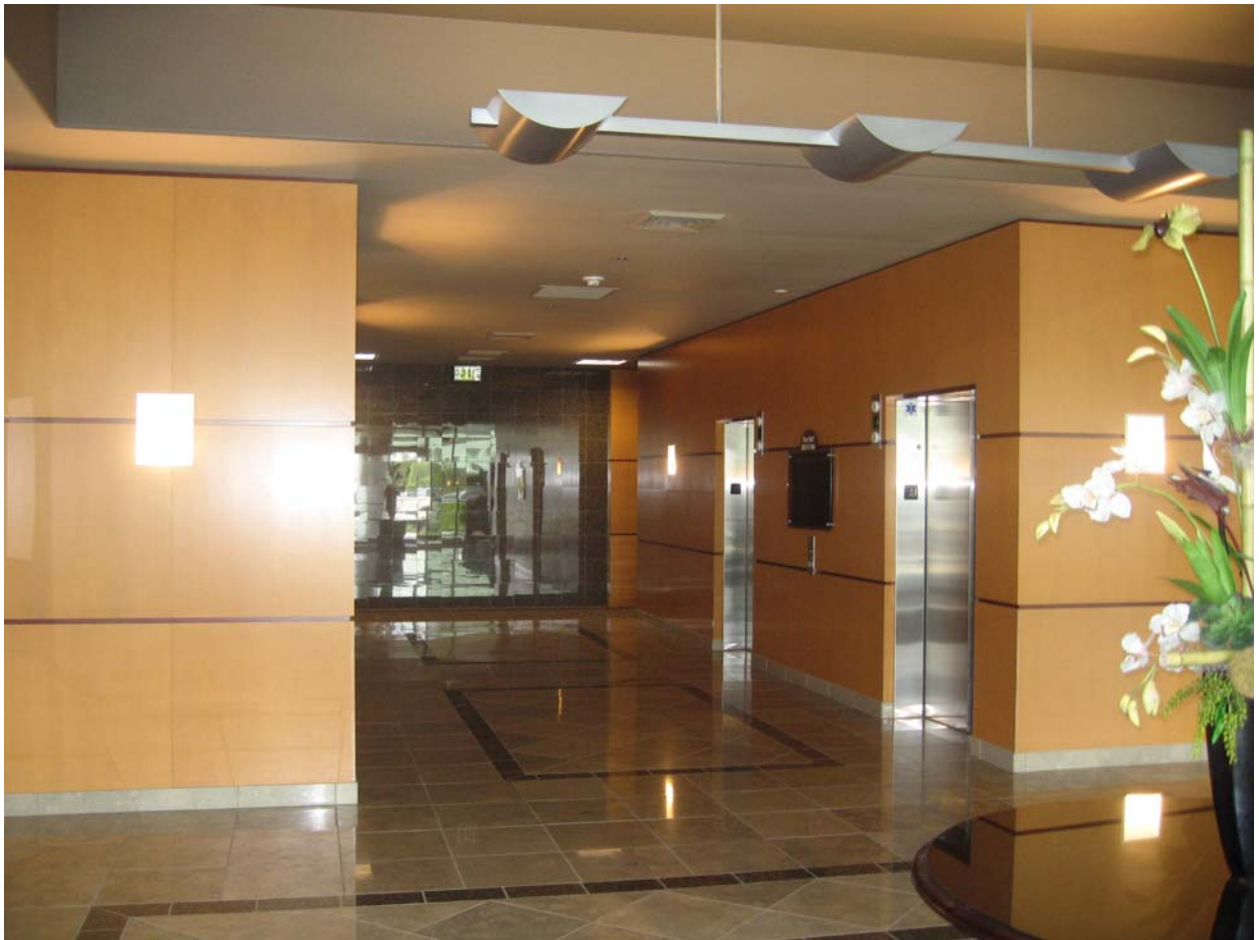
8050 N. Palm Ave.