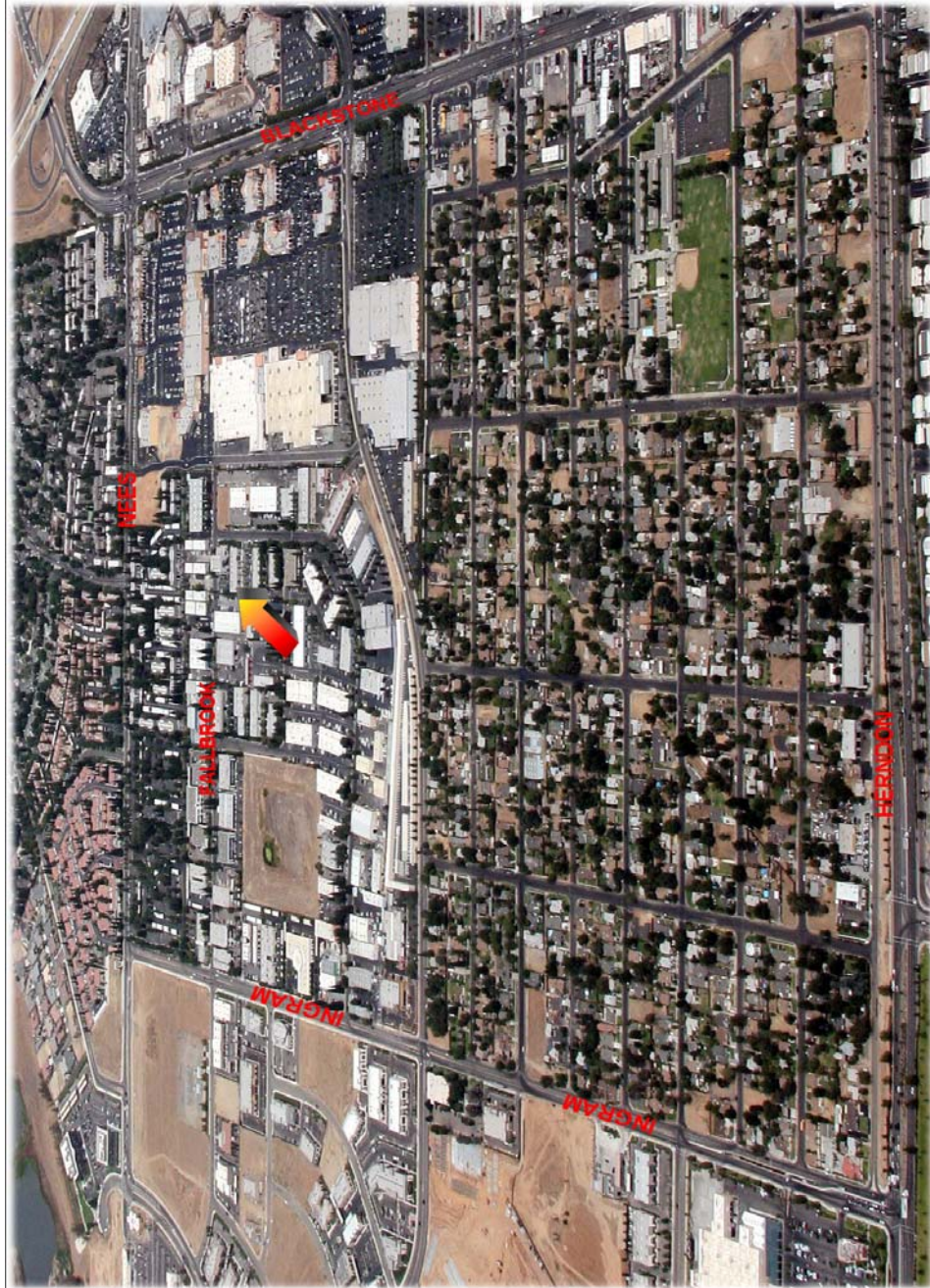
7621 N. Del Mar Aerial View